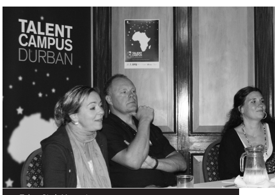
▲ Talent Pitch Mentoring

See page 7 for more details on Single Shot Cinema.